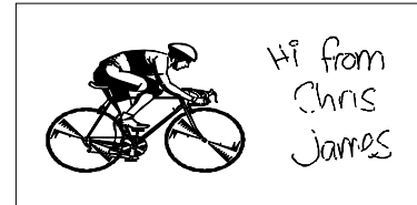
Sample image #2